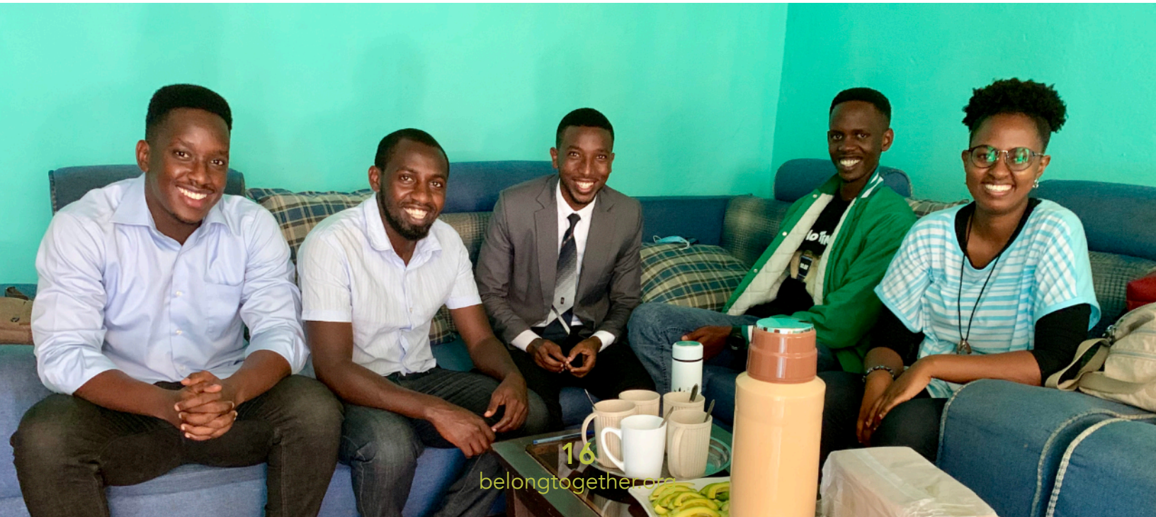
BT leaders and friends

If it is God's will for you to be part of Belong Together in a financial capacity, we thank God for what He has given you that would share with us for the furthering of the Gospel in Rwanda.