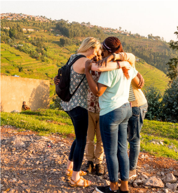
GIHEMBE REFUGEE CAMP

Every action in our life is building upon something. At Belong Together, we want the base of all we do to be built upon prayer. Prayer is nothing small to us. Thank you for joining us to pray for our needs, and as the Spirit leads you!